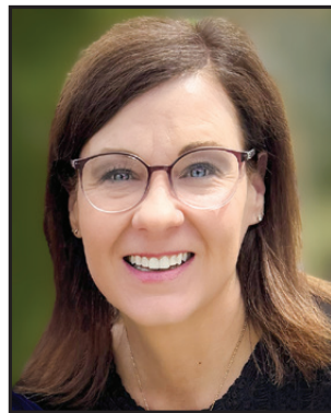
Mayor Cherie Wood