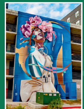
GOMAD Mural Fest 2025