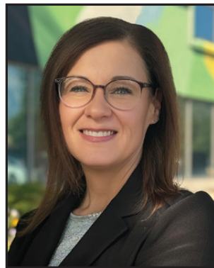
Mayor Cherie Wood