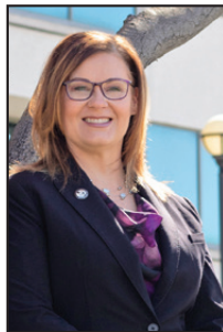
Mayor Cherie Wood

Emergencies 911 Police/Fire Dispatch 801-840-4000