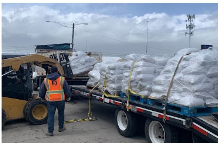
SSL Public Works as well as our city employees started in early April to fill over 15,000 sandbags. On April 14 the City launched community sandbag-filling volunteer opportunities for the public.