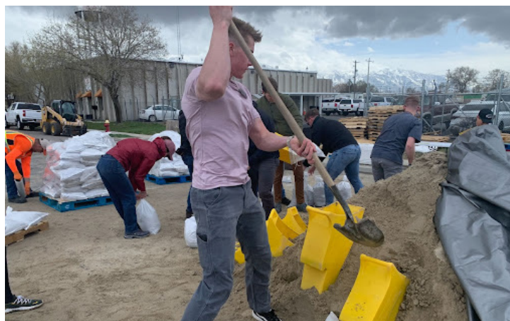
A very wet and stormy day didn't stop this group of LDS missionaries from attending a volunteer shift and stacking several pallets with sandbags.