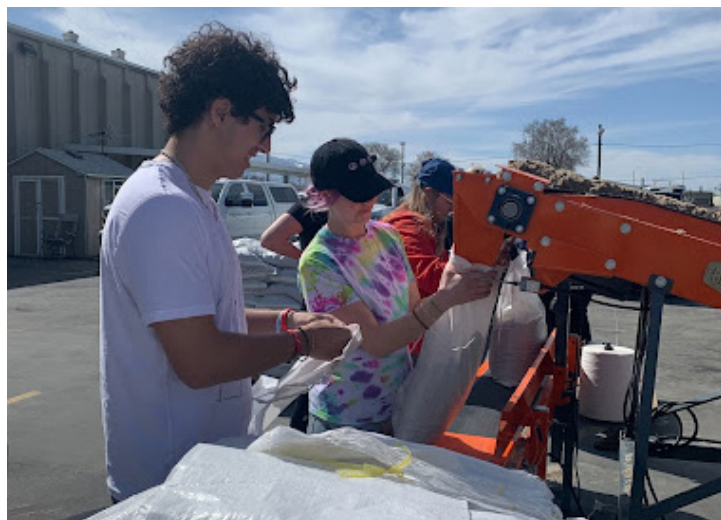
Starting in April, City staff and community volunteers joined at the SSL Public Works campus to fill sandbags, both by hand and using a fast-fill sandbag machine.