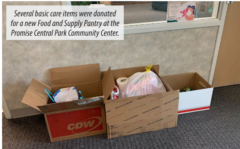
Several basic care items were donated for a new Food and Supply Pantry at the Promise Central Park Community Center.