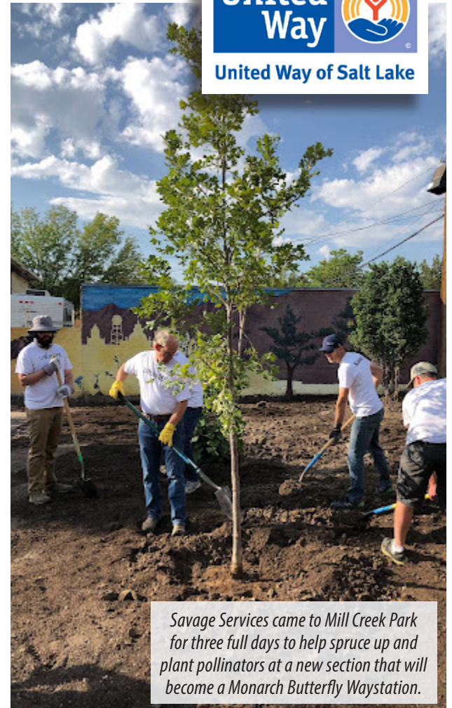
Savage Services came to Mill Creek Park for three full days to help spruce up and plant pollinators at a new section that will become a Monarch Butterfly Waystation.