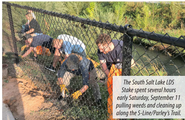
The South Salt Lake LDS Stake spent several hours early Saturday, September 11 pulling weeds and cleaning up along the S-Line/Parley's Trail.