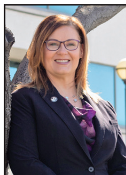
Mayor Cherie Wood

amenities that support and preserve our great neighborhoods—I'd like to say it's our superpower.