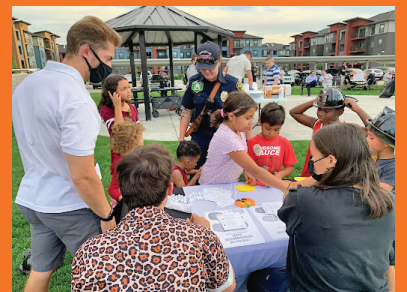
SSL Youth getting crafty at the Neighborhood Night in September