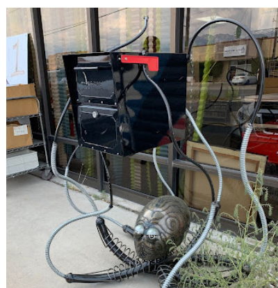
This mailbox held up by an Octopus, is found in front of Clever Octopus Creative Reuse Center and was designed by Sugarpost.